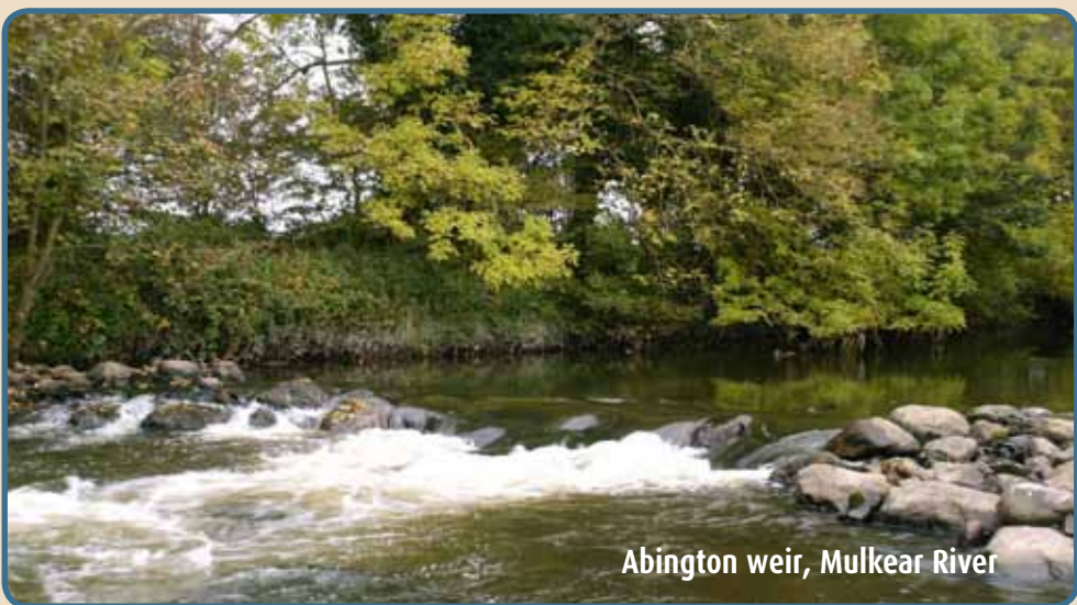
Abington weir, Mulkear River

The Flying 'C' is a popular choice of lure and comes in different sizes and colours to suit the water levels and clarity of the river. Popular Salmon flies include a range of shrimp fly patterns, such as Ally's, Cascade, Claret and Silver Shrimps.