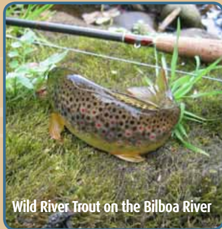
Wild River Trout on the Bilboa River