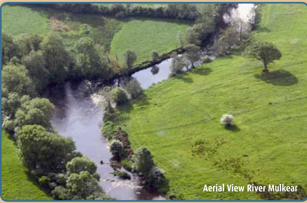
Aerial View River Mulkear